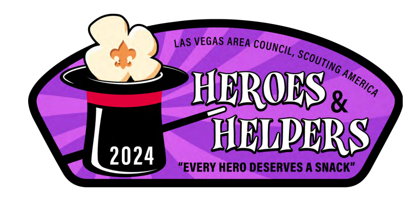
"2024 Popcorn Participation Patch"